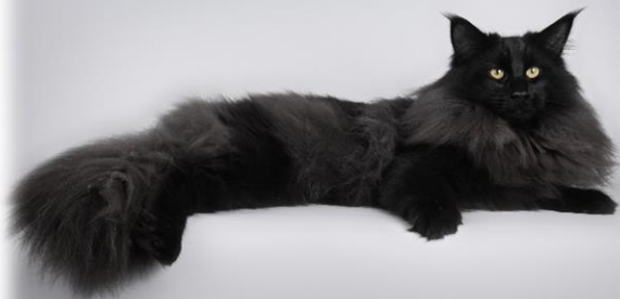
Breeding male at NO*Havstrilens

Be sure to perform tests that are mandatory for your breed before mating.